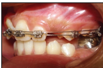
661 Fixed Biteplane