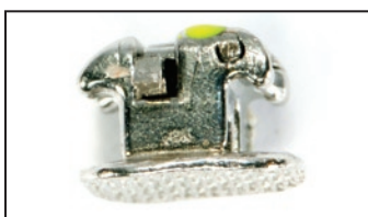
641 Self-Ligating Appliances